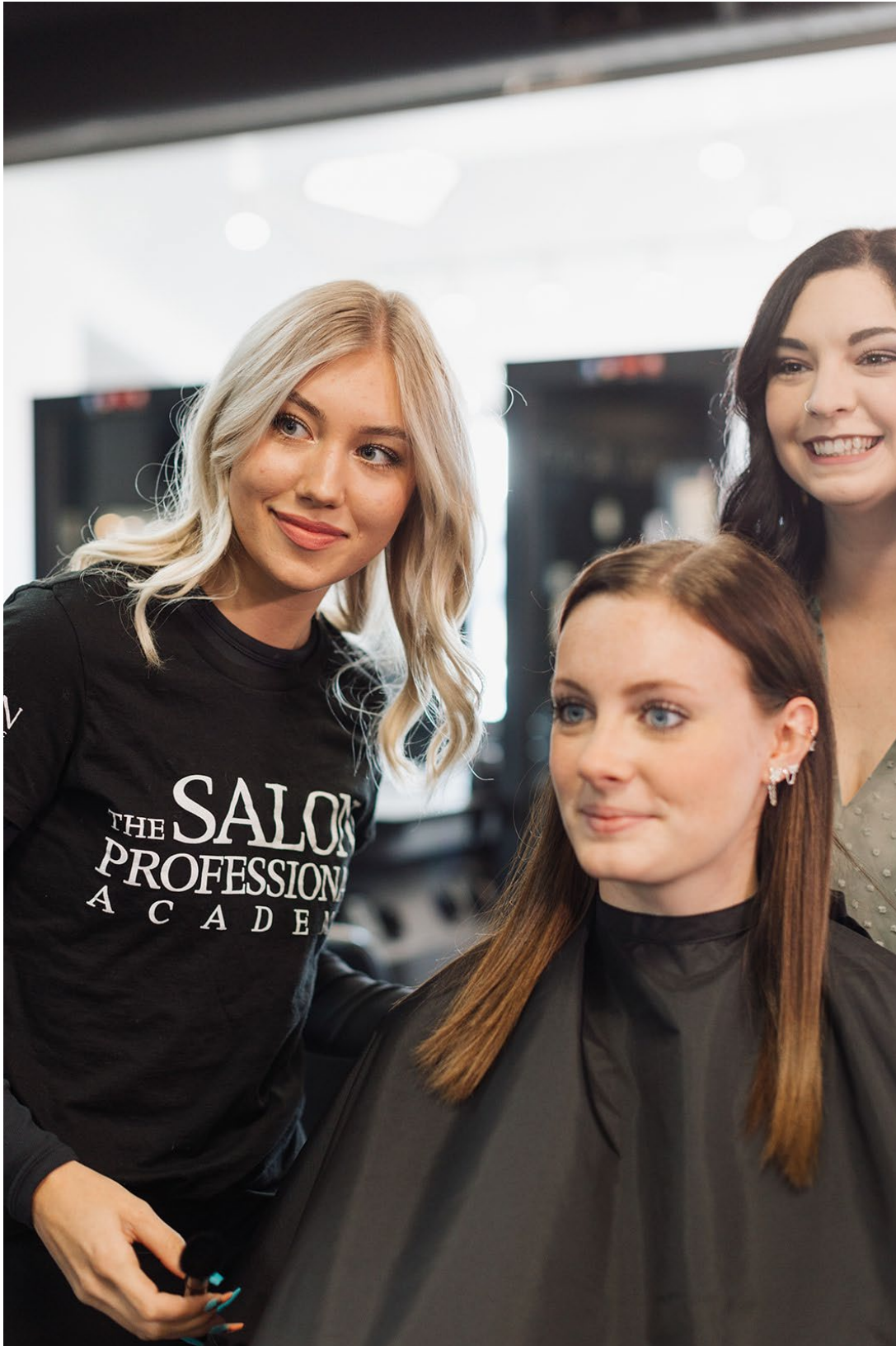
Page 66 of 85