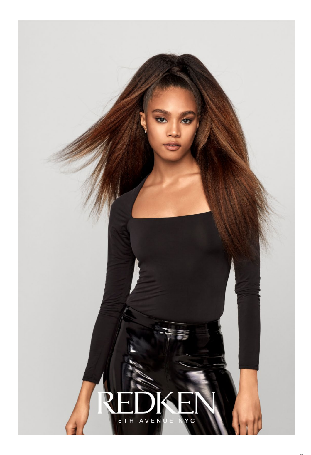
Page 37 of 70 The Salon Professional Academy located in San Jose, CA 2-2023 Catalog