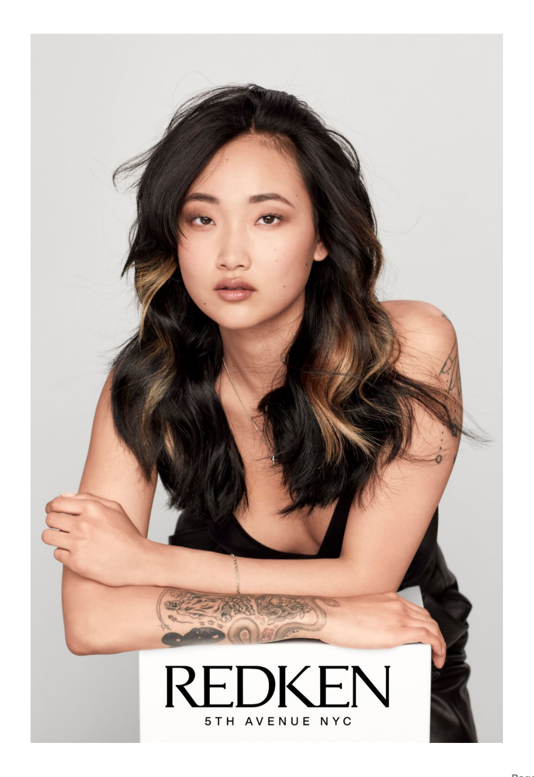
Page 52 of 70